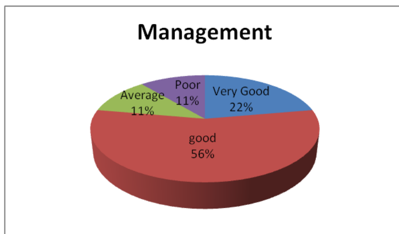
Table: 2 Views of Employees on T., D. & C. Practices in industrial Ceramic Units in Gujarat.

Source: Based on compiled and analyzed data collected through fieldwork.